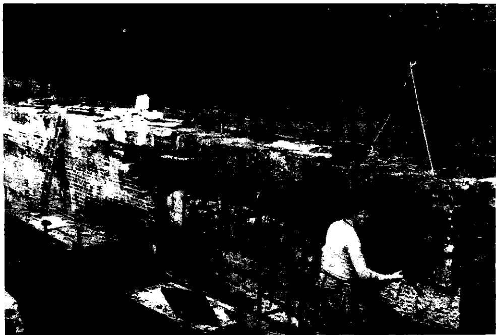
ABOVE: Clearing up after the August Work Camp BELOW: One of our special parties from Common Weal School, Swindon