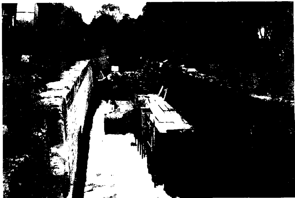
Progress on the East wall at Cerney Wick.